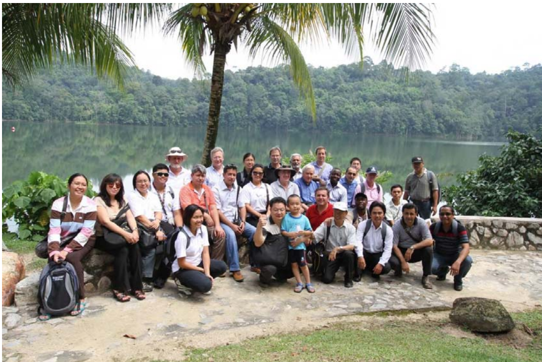
Participants relax en route